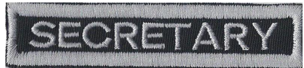
(example club officer)