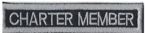
(original charter/chapter member)

MOST PATCHES ARE AVAILABLE FROM THE NATIONAL CHAPTER